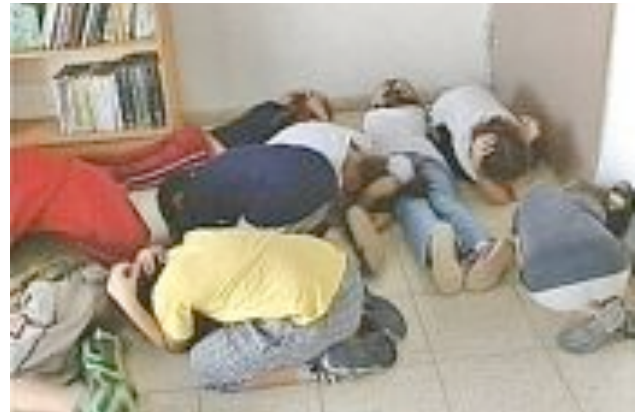
Children of Sderot know only too well the "Duck and cover drill," only in their case it isn't a drill.

My goal is to raise $500, and I am already half way there. I am raising money in many ways for this project: 1) making and selling scarves, 2) car washes, 3) a bike-a-thon, and 4) a swim-a-thon. At recent Sisterhood and membership events, I signed up a number of people for a chance to buy a scarf (minimum donation $7), sign up for a car wash (held at my house in Cheverly on Sundays July 26, August 2 and 30 from 10 a.m. to 4 p.m. for $12 per car), or make pledges for my swim-a-thon and bike-a-thon. I also displayed a poster with information about the project so you could see what any donations will go to. I hope you will consider helping support my project for the indoor playground in Sderot.