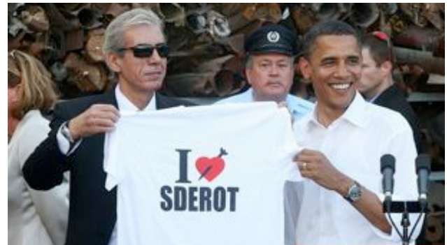
Then candidate Barack Obama joins Sderot Mayor Eli Moyal in displaying an I love Sderot T-shirt.